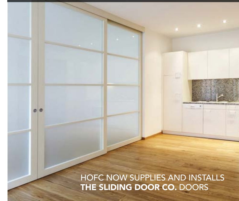
HOFC NOW SUPPLIES AND INSTALLS THE SLIDING DOOR CO. DOORS