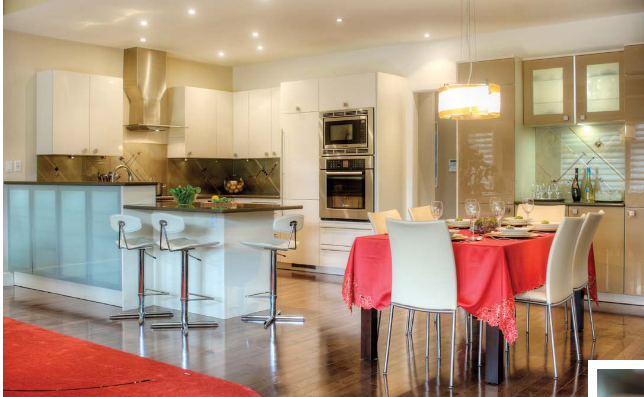
FAR LEFT: The refrigerator blends seamlessly with the kitchen cabinetry. LEFT: The kitchen's sleek white palette is accented with punches of colour. BELOW LEFT & CENTRE: Steps away from the kitchen is the laundry room, which features a full-sized upright freezer, also cleverly disguised.