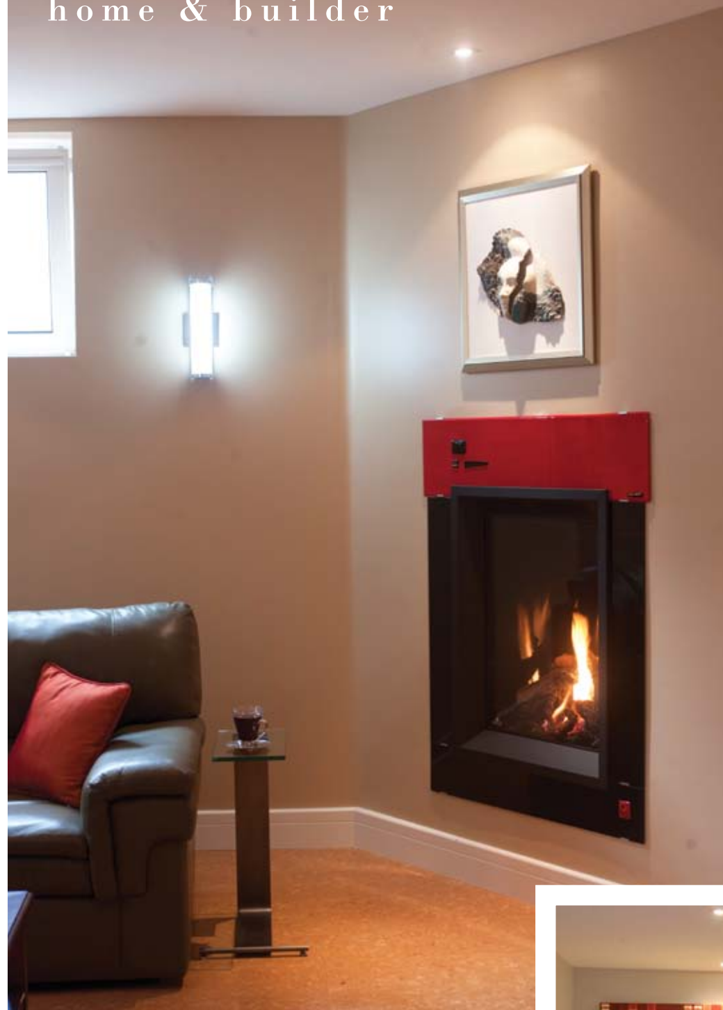
LEFT: The basement was designed with warmth in mind. Cork floors with radiant heating and a gas fireplace with custom surround make for stylish, comfortable touches. BELOW: Sofia chose a contemporary glass staircase design (Rossen Glass & Mirror Co.) for the stairs leading to the basement. BOTTOM: The lower level has a wet bar and coffee station, perfect for entertaining.