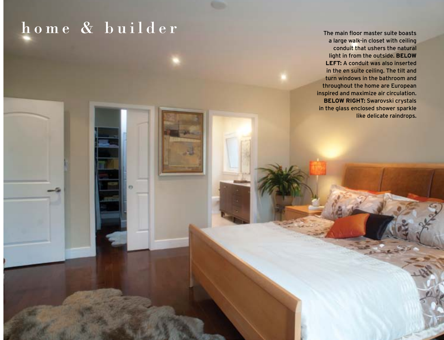
The main floor master suite boasts a large walk-in closet with ceiling conduit that ushers the natural light in from the outside. BELOW LEFT: A conduit was also inserted in the en suite ceiling. The tilt and turn windows in the bathroom and throughout the home are European inspired and maximize air circulation. BELOW RIGHT: Swarovski crystals in the glass enclosed shower sparkle like delicate raindrops.