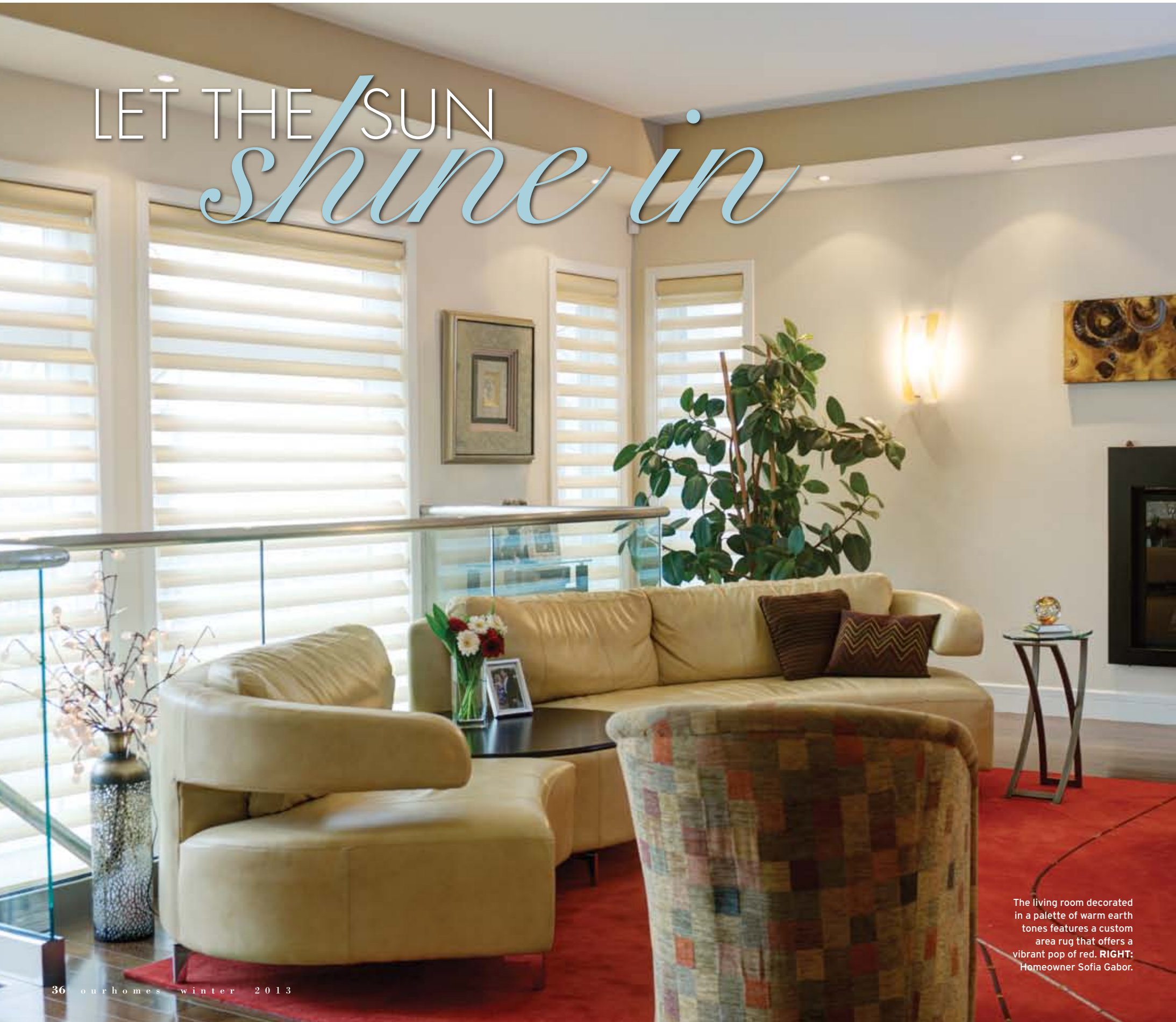
The living room decorated in a palette of warm earth tones features a custom area rug that offers a vibrant pop of red. RIGHT: Homeowner Sofia Gabor.